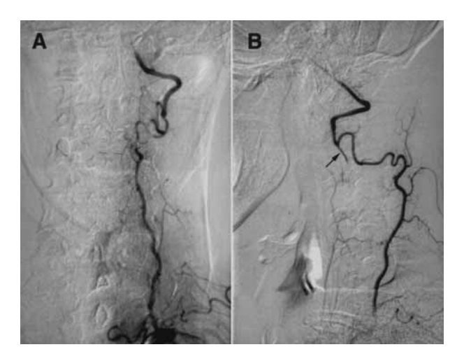
FIG. 2A. — A. Early arteriogram, showing the occlusion of the left proximal vertebral artery. The deep cervical artery fils the extradural artery by the posterior longitudinal anastomosis at the level of C3; B. Late arteriogram showing the backflow of the distal part of the occluded left vertebral artery (arrow). The proximal branches of the anterior artery are not visible.

Medial medullary infarcts are rare and represent only 1% of cases of vertebro-basilar stroke (Kim et al., 1995; Bassetti et al., 1997; Kumral et al., 2002). The most common causes of these infarcts are an atherosclerotic stenosis or occlusion, and a dissection of the ipsilateral vertebral artery (Kim et al. 1995; Bassetti et al., 1997; Kumral et al., 2002). The mean discussion in this case report is to explain the occurrence of a low medial medullary infarct in the territory of the left branch of the anterior spinal artery, in case of an occlusion of the proximal upper cervical segment of the left vertebral artery. The anterior spinal artery is commonly formed rostrally by the union of the descending anterior spinal branches issued from the intracranial part of both vertebral arteries in 75% of the cases, with a balanced or a dominant right or left branch (Govsa et al., 1996). However, there exists